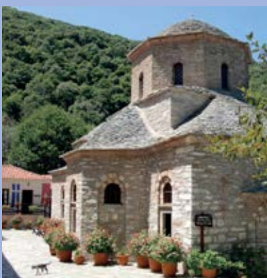
Monastery of Evangelistria