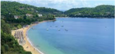
Aghia Paraskevi beach

Outside the hotel there are a number of local tavernas and the bus stop for town.